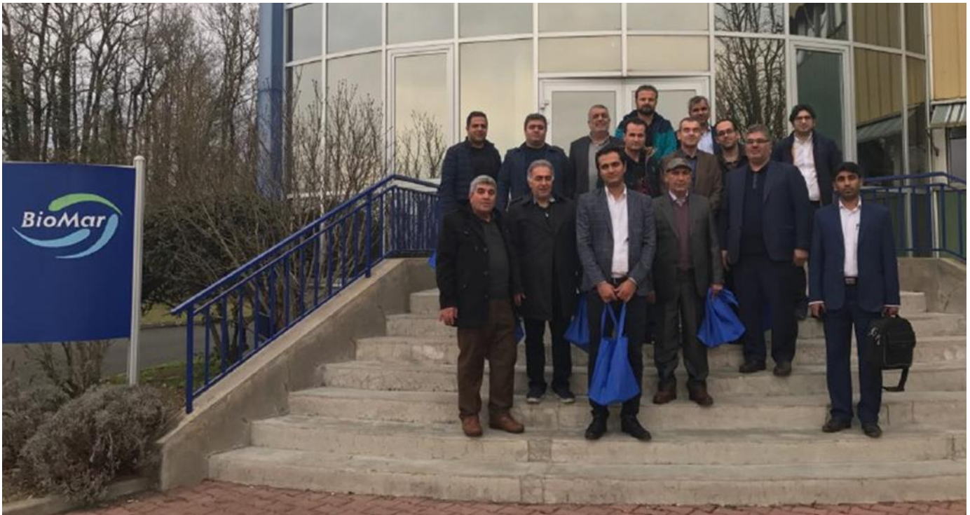
Visit to Biomar Company, Aquaculture feed company, Nersac, France- February 20th 2017

Technology Units Incubator, Shahid Beheshti University, Daneshjoo St., Velenjak, Tehran, IRAN. Post Code: 1983963113 Tel: +98(21)22419445 Fax: +98(21)22419445 Web Site: www.pezhvac.com E-mail: info@pezhvac.com Reg. Code.:462000 National code:14004474063