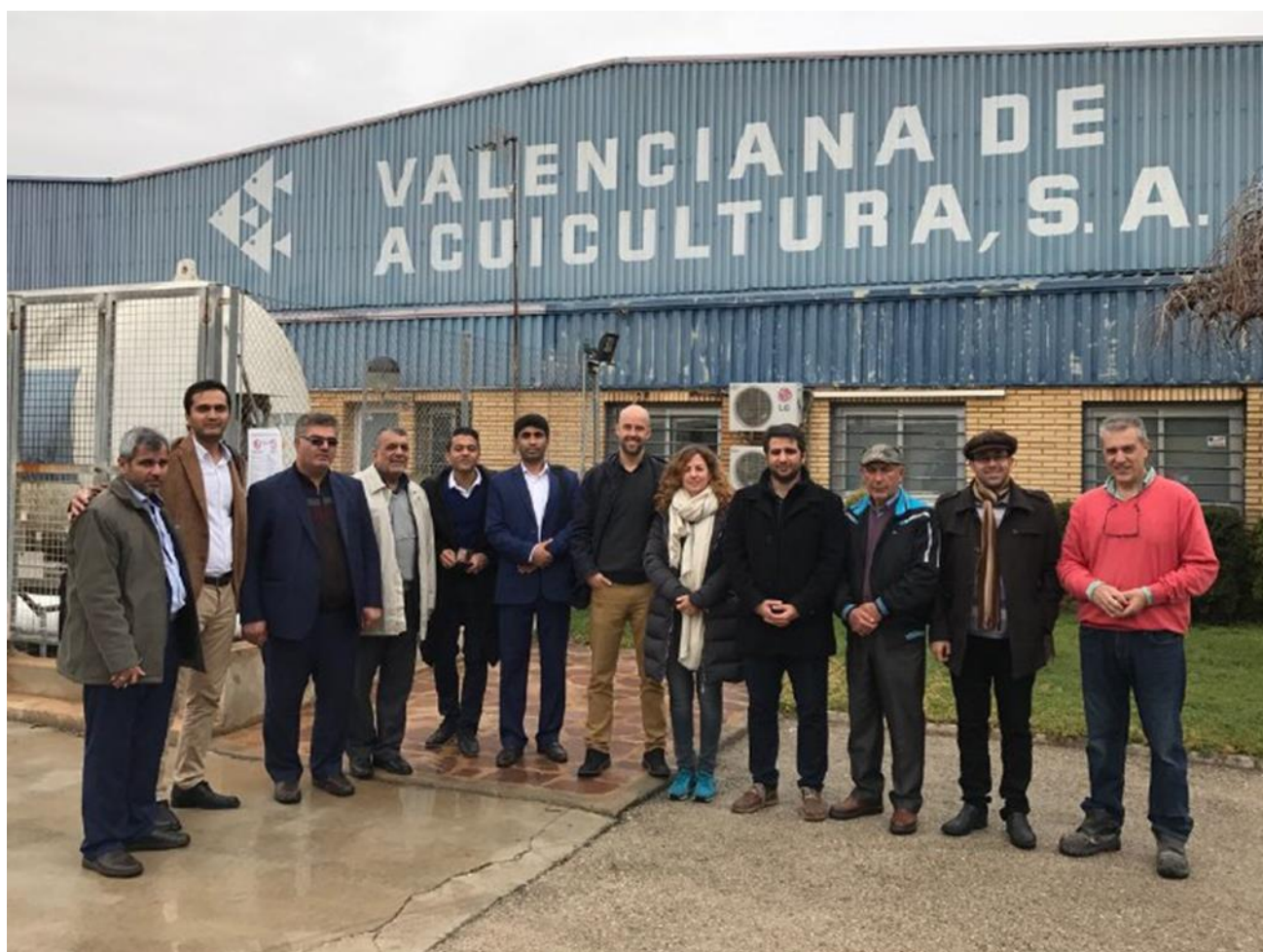
Visit to Valaqua farm with RAS, Valencia, Spain, February 24 th 2017

Technology Units Incubator, Shahid Beheshti University, Daneshjoo St., Velenjak, Tehran, IRAN. Post Code: 1983963113 Tel: +98(21)22419445 Fax: +98(21)22419445 Web Site: www.pezhvac.com E-mail: info@pezhvac.com Reg. Code.:462000 National code:14004474063