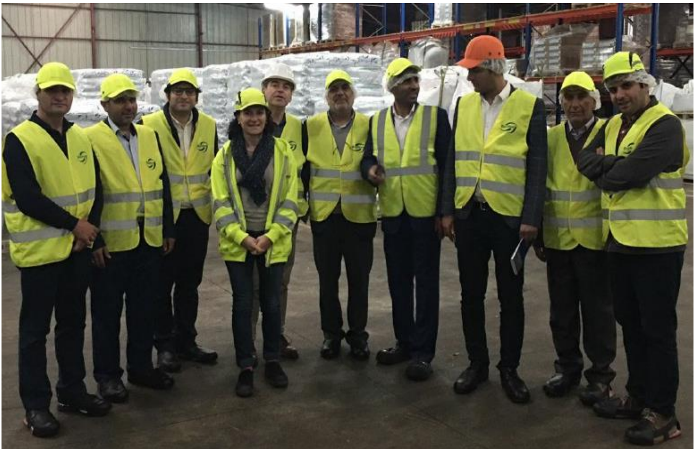
Visit to Biomar Feed production line in its factory, Nersac, France- February 20th 2017