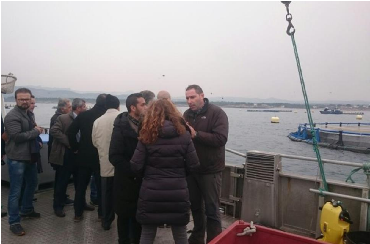
Visit to Invermar cage aquaculture farm in Tarragona, Spain, February 23 rd 2017