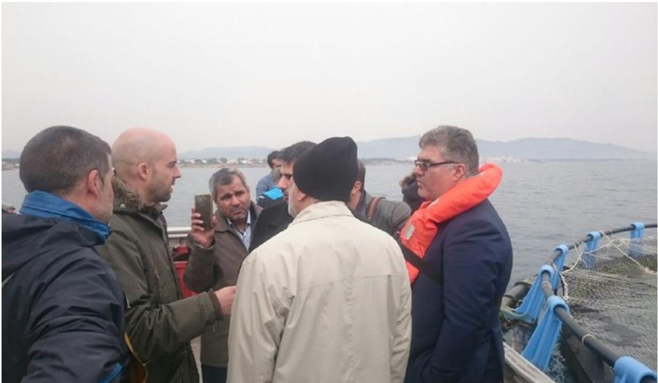
Visit to Invermar cage aquaculture farm in Tarragona, Spain, February 23 rd 2017