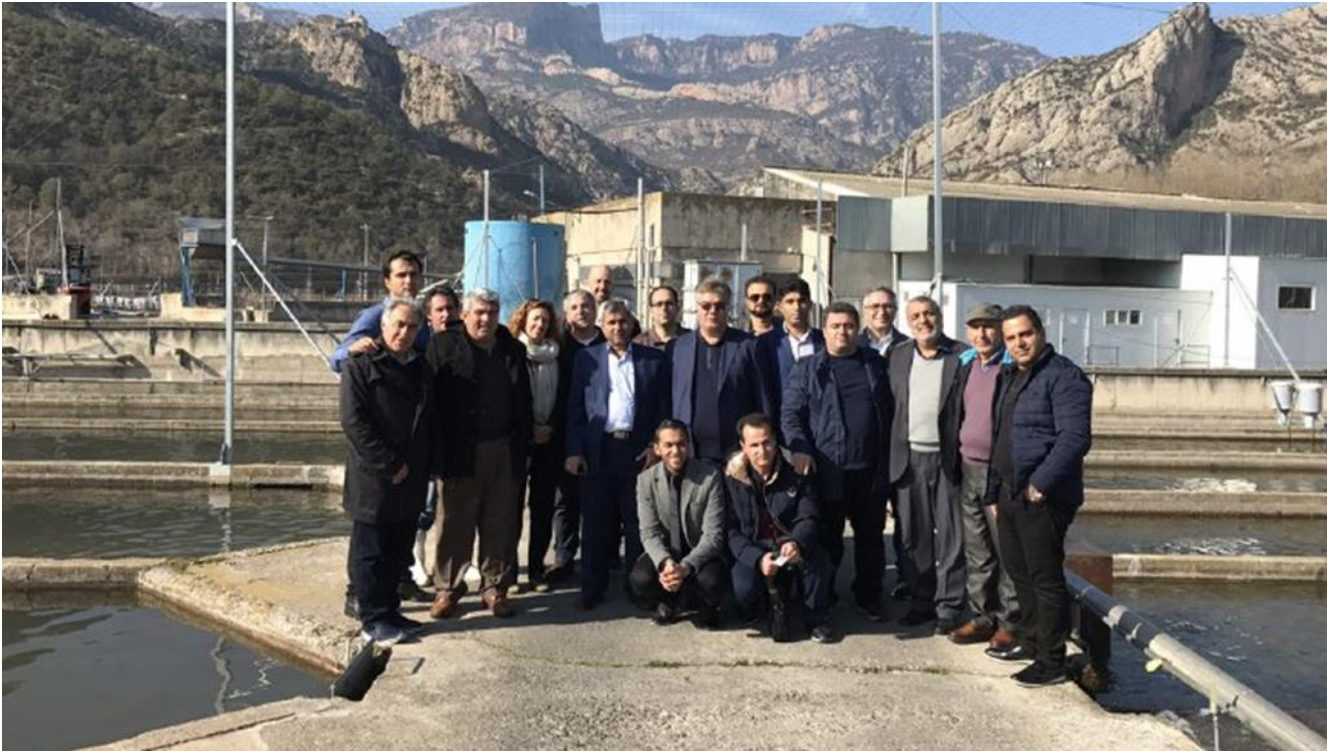
Visit to Truchasdelsegre Trout farm, Lleida, Spain, February 22 nd 2017