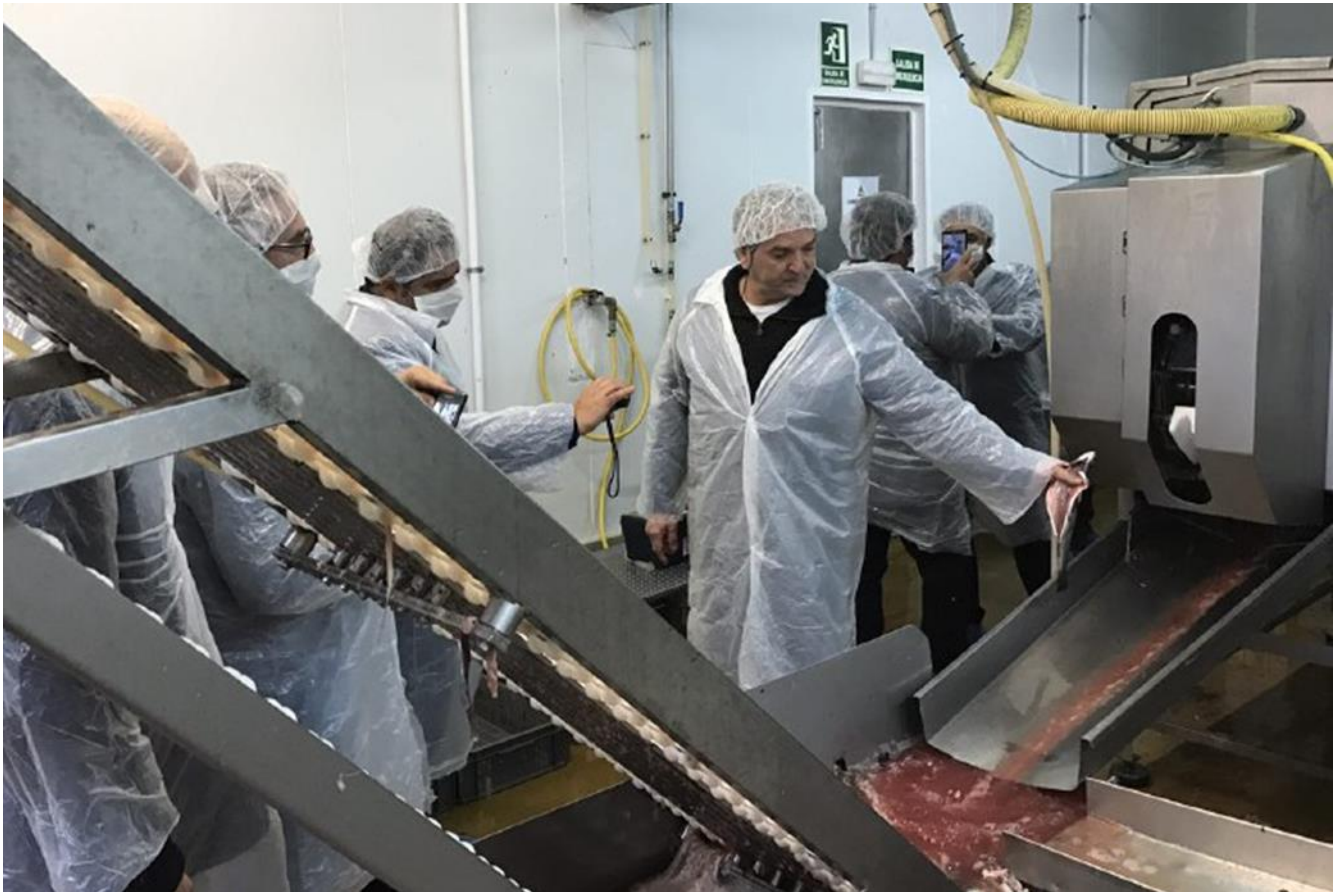
Visit to Truchasdelsegre processing site, Lleida, Spain, February 22 nd 2017