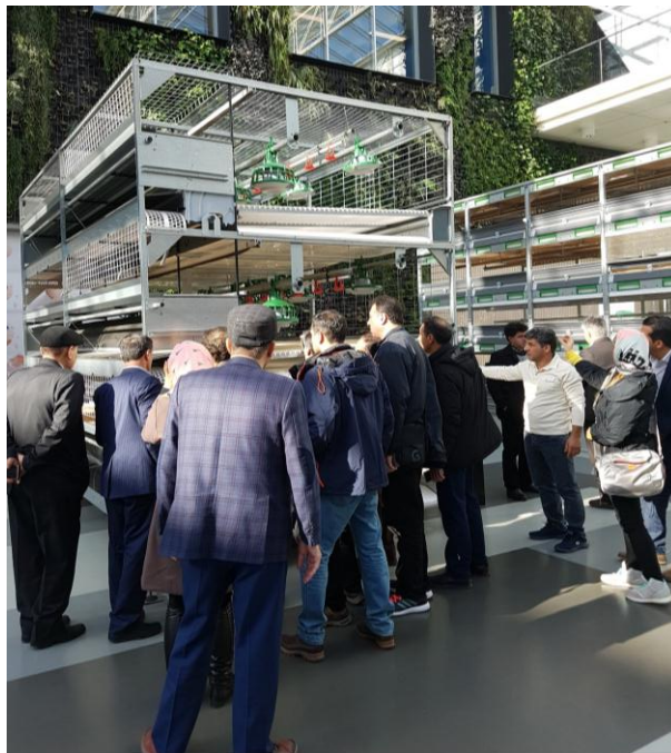
Tour on campus site with question and answer – Eersel- Netherlands- february 14 th 2017