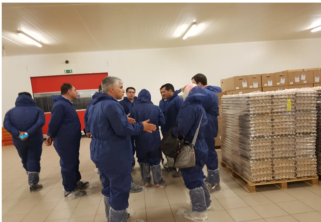
Visit to Belgabroed hatchery – Merksplas- Belgium- February 15 th 2017

Technology Units Incubator, Shahid Beheshti University, Daneshjoo St., Velenjak, Tehran, IRAN.