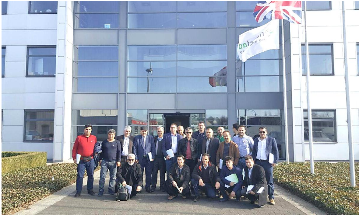
Visit to INVE België Company – Dendermonde – Belgium- February 15 th 2107

پژواک پژوهش ایده کاوش (سهامی خاص) Research & Innovation Co.