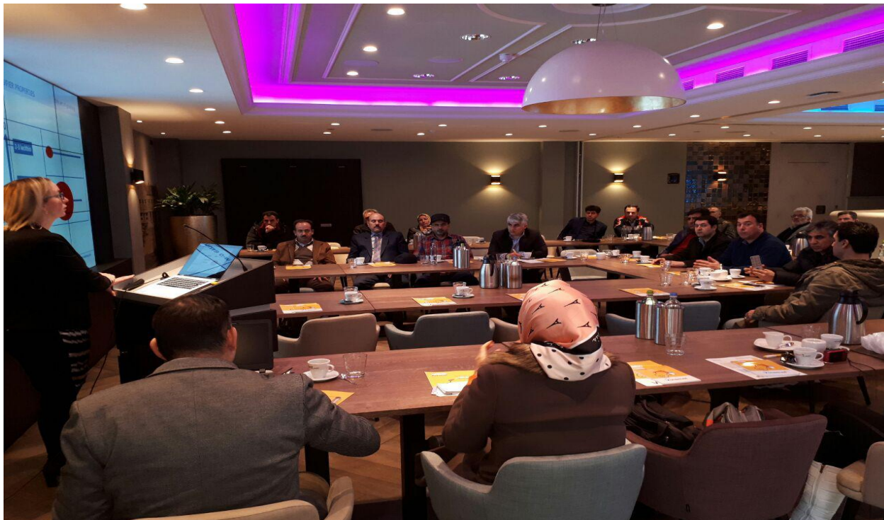
Presentation and question and answer meeting- Weert- Netherlands- February 16 th 2017