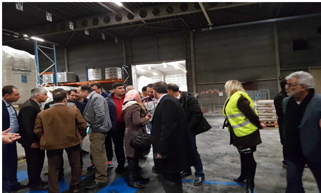
Visit to Nukamel production line- Weert- Netherlands- February 16 th 2017

Technology Units Incubator, Shahid Beheshti University, Daneshjoo St., Velenjak, Tehran, IRAN.