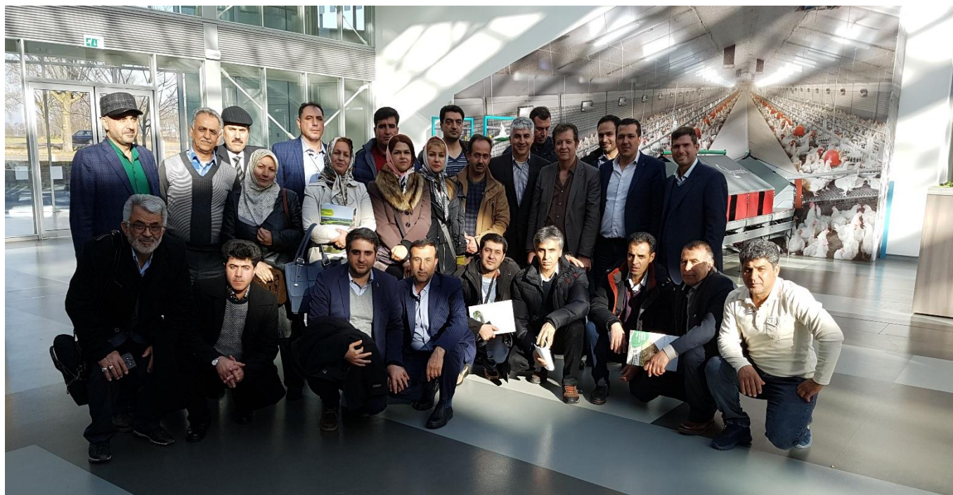
Visit to Venco Campus of Vencomatisgroup- Eersel- Netherlands- February 14 th 2017

Technology Units Incubator, Shahid Beheshti University, Daneshjoo St., Velenjak, Tehran, IRAN.