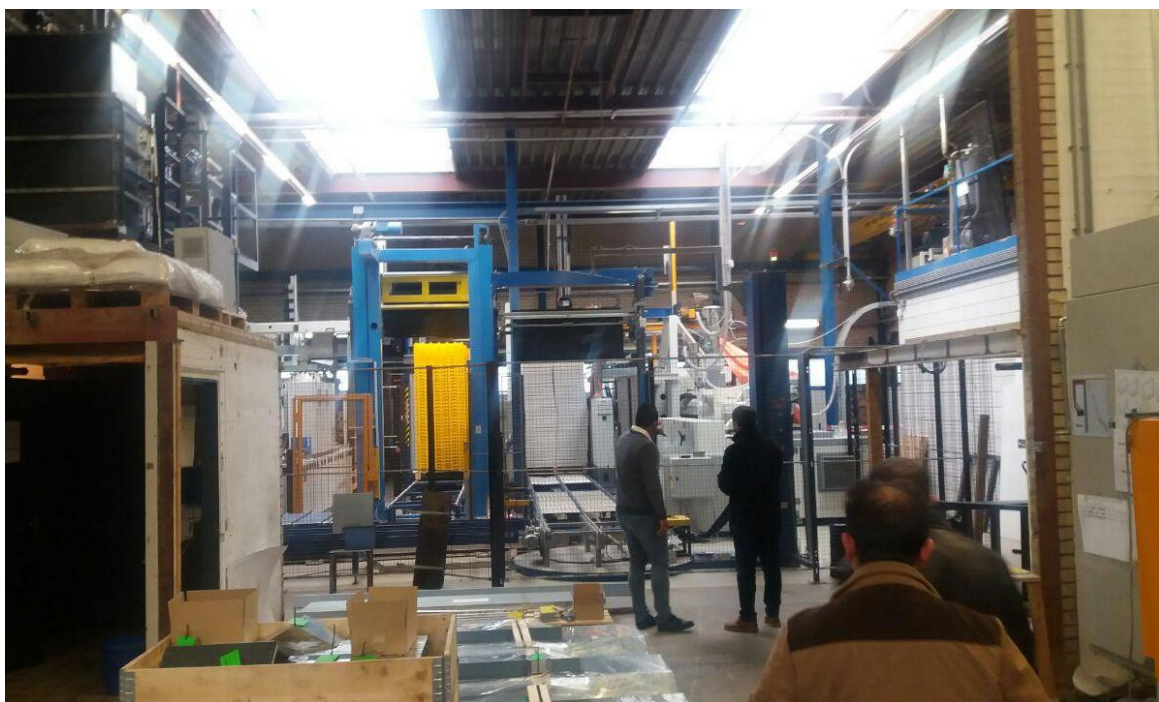
Visit to manufacturing line of Jonsen Poultry Equipment Site- Barneveld- Netherlands- February 17th 2017

Technology Units Incubator, Shahid Beheshti University, Daneshjoo St., Velenjak, Tehran, IRAN. Post Code: 1983963113 Tel: +98(21)22419445 Fax: +98(21)22419445 Web Site: www.pezhvac.com E-mail: info@pezhvac.com Reg. Code.:462000 National code:14004474063