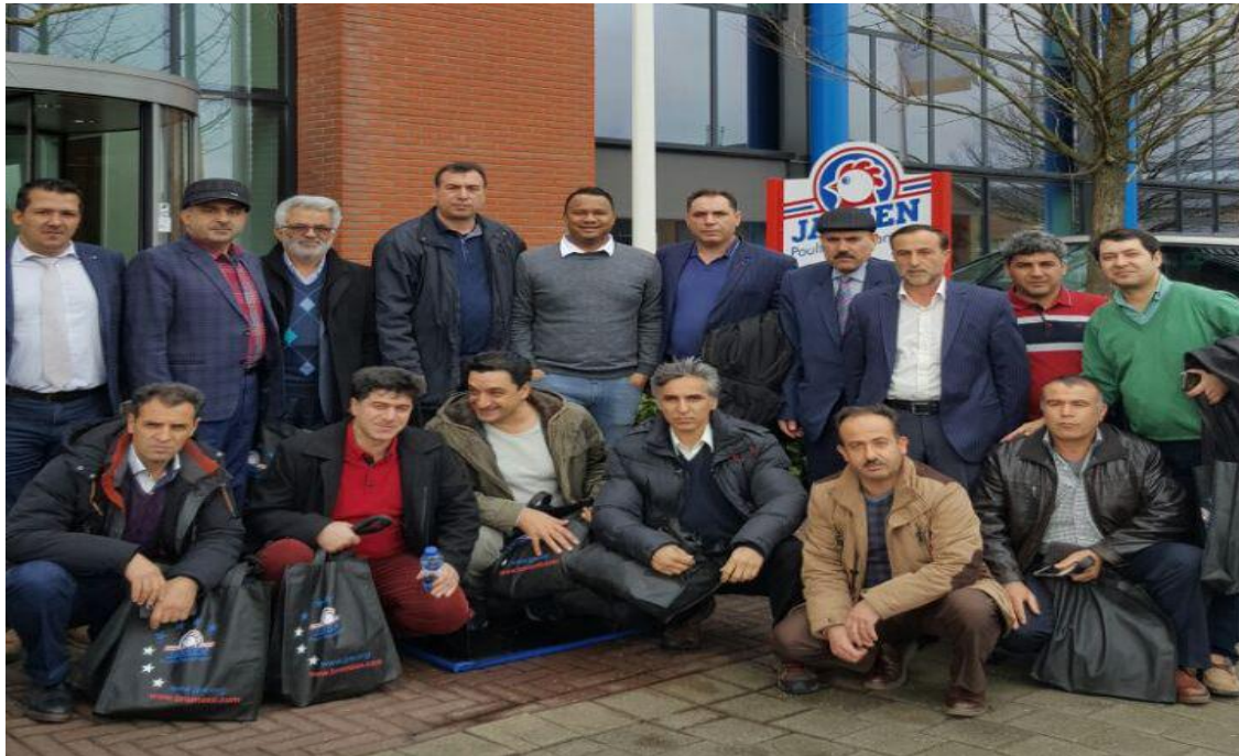
Visit to Jonsen Poultry Equipment company –Barneveld- Netherlands- February 17 th 2017

پژواک پژوهش ایده کاوش (سهامی خاص) Research & Innovation Co.