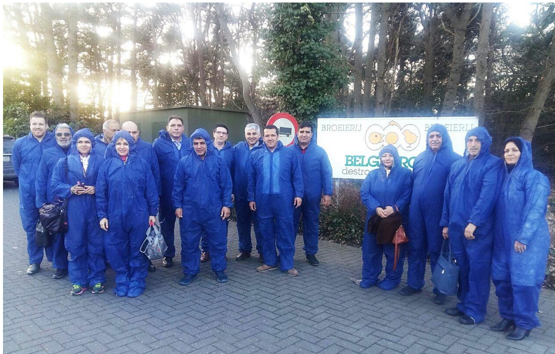
Visit to Belgabroed hatchery – Merksplas- Belgium- February 15 th 2017